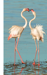
Linda Death 14 / 15