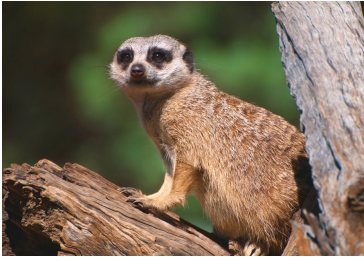
Chris Randall 14 / 15